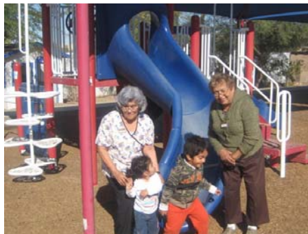
Grandmas enjoy playing with the children and helping them learn what they can do. While the kids are getting their exercise, grandmas notice the children run everywhere!